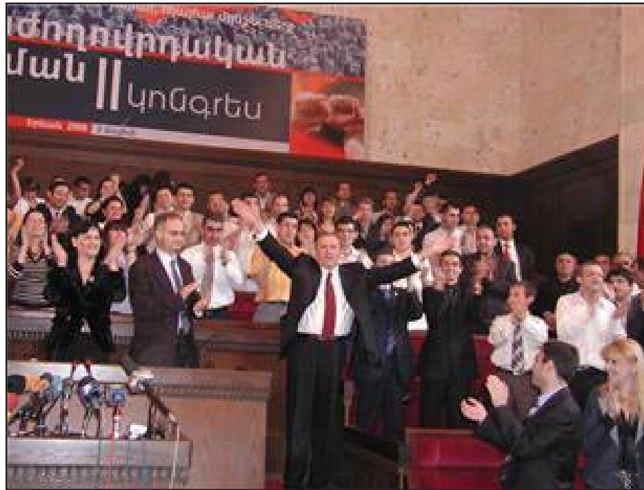
Levon Ter-Petrosian waving to his supporters during the pan-national movement congress

President Levon Ter-Petrosian delivered his first public speech since March 1 and typically it was long, divided into several parts -- "Clash or Slaughter", "Western attitude towards Armenian elections and the March 1 events", "Split or Unification of Soci-