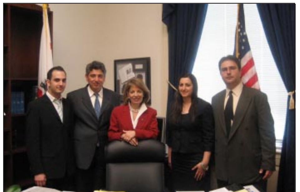
ACA delegation with Representative Jackie Speier at her Capitol Hill office

WASHINGTON, DC -- The Armenian Council of America on April 23 congratulated former California State Senator Jackie Speier (D-CA) on winning a special election to fill the House seat for the late Rep. Tom Lantos (D-CA). With her much deserved victory, Speier now joins fellow California lawmaker Rep. Anna Eshoo (D-CA), as the second American of Armenian descent to serve in the 110th Congress.